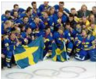
Train like the world's best!